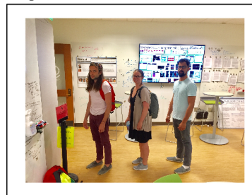
Figure 1: Marr's levels of analysis for waiting in line.

each standing behind another. This social behavior implements the computation of a first-in, first-out (FIFO) queue. A FIFO queue is a simple function used in computer science, for example to prioritize computer processes in the CPU. A FIFO queue takes as input a stream of entries, maintains the order of those entries, and outputs entries in that order. The representation that is used to solve the FIFO queue problem in the case of waiting in line is to maintain a linked list data structure between elements of the queue, and pop elements off the list as needed. A linked list is another data structure used computer science, in which each entry contains a "pointer" to the next element in the list. To "pop" a linked list means to remove the head element. In the example of waiting in line, the distributed algorithm that implements this linked list is for each person in the line to keep track of who is ahead of them. The physical implementation used to keep track of who is ahead of you in the line is simply to stand behind that person. Figure 1 illustrates this example.